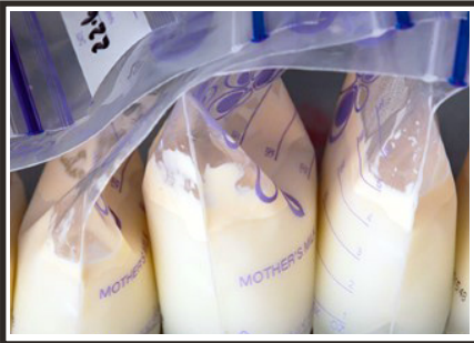
whattoexpect / working moms

Break Time to Pump Breast Milk An employer may not deny a covered employee a needed break to pump. Employees who telework are eligible to take pump breaks under the FLSA on the same basis as other employees. The frequency and duration of breaks needed to express milk will likely vary depending on factors related to the nursing employee and the child.